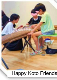
Happy Koto Friends