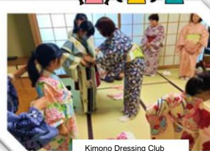
Kimono Dressing Club