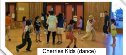
Cherries Kids (dance)