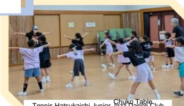
Tennis Hatsukaichi Junior Jazz Dance Club