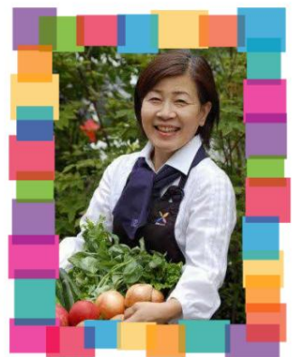
Lecturer: Advanced Vegetable