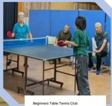
Beginners Table Tennis Club