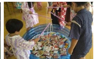
Miyazono District Summer Festival for children