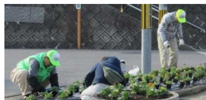
Sakata District Flowers planting