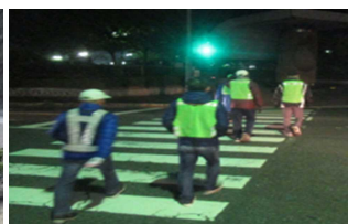
Kushido District Patrolling at night