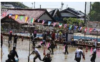
Hara District Doronko Valley

Let's make our city more progressive with your help.